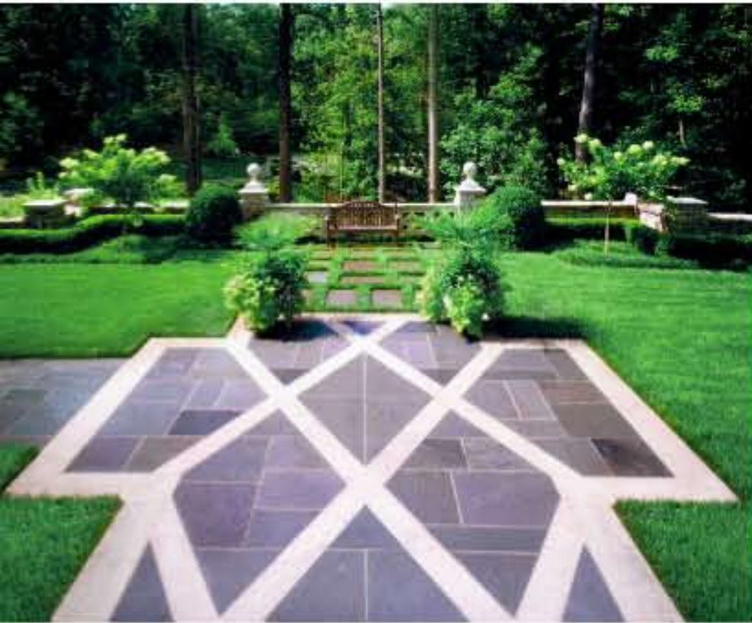
THE ENGLISH COUNTRY STYLE OF THIS HOME IS EMPHASIZED BY THE LONSTONE WALLS AND LIMESTONE COLUMN CAPS THAT EMBRACE THE RECEIVING GARDEN.