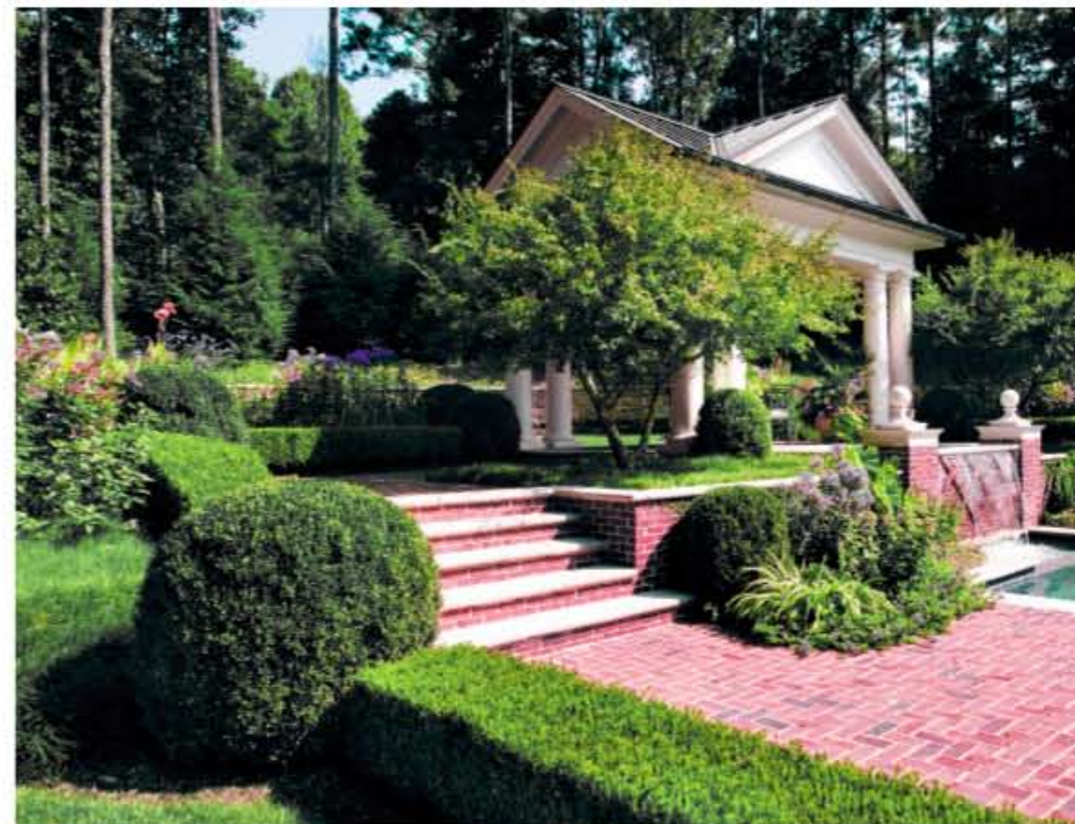
A LARGE GARDEN OF MIXED PERENNIALS IS GIVEN ARCHITECTURAL STRUCTURE BY AMERICAN AND KOREAN BOXWOOD HEDGING.