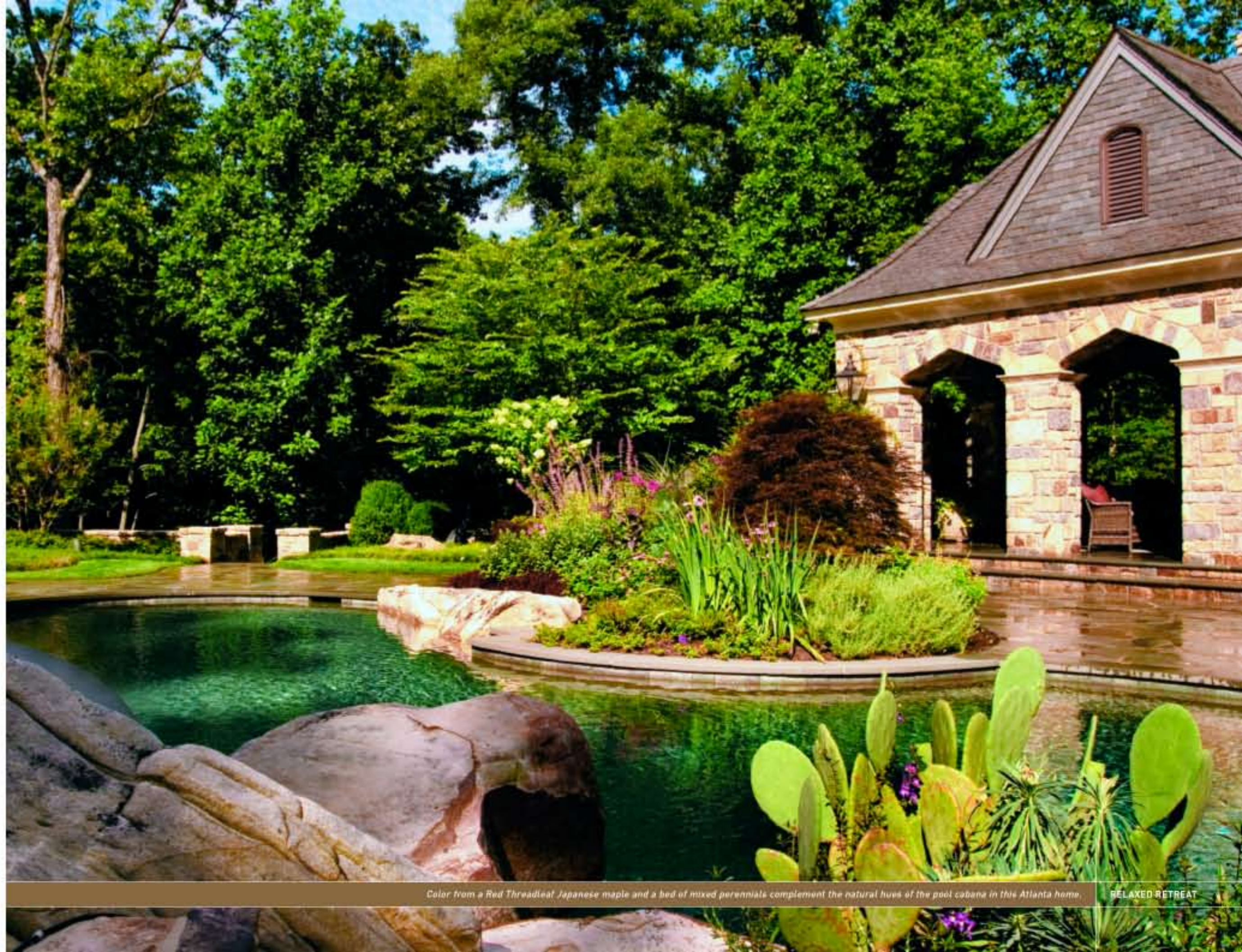
Color from a Red Threadleaf Japanese maple and a bed of mixed perennials complement the natural hues of the pool cabana in this Atlanta home.