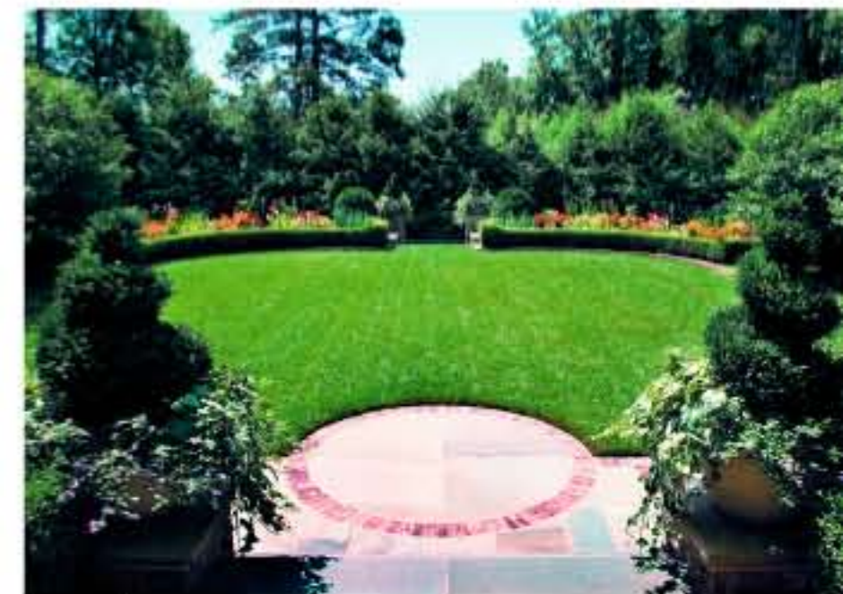
A PATIO OF BLUESTONE TILES BANNED IN BRICK CREATES A FOREGROUND FOCAL POINT OVERLOOKING THIS ENTERTAINING GARDEN.