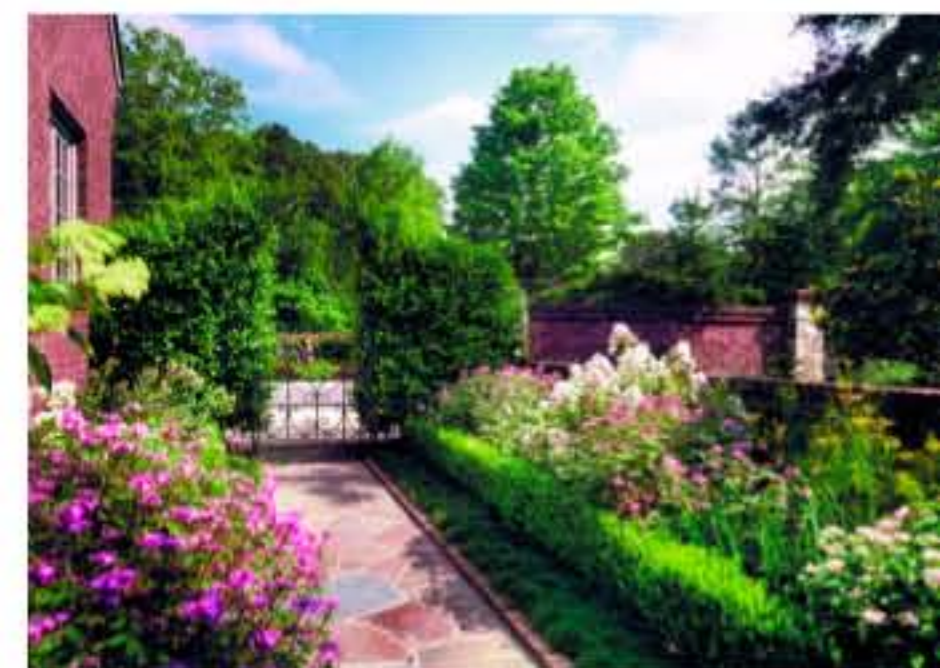
A PATHWAY OF BROKEN BLUESTONE BORDERED BY A RAISED BRICK CURB LEADS TO AN ORNAMENTAL IRON GATE AND ARCHWAY TRELLIS OF CHERRY LAUREL.